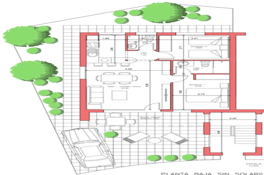
PLANTA BAJA SIN SOLARIUM VIVIENDA 054 SUP. PARCELA= 151,90 M2.

SUP. UTIL : 59,00 M2. SUP. CONSTRUIDA: 70,00 M2. SUP. DE PARCELA NETA: entre 117,00 y 201,00 M2.